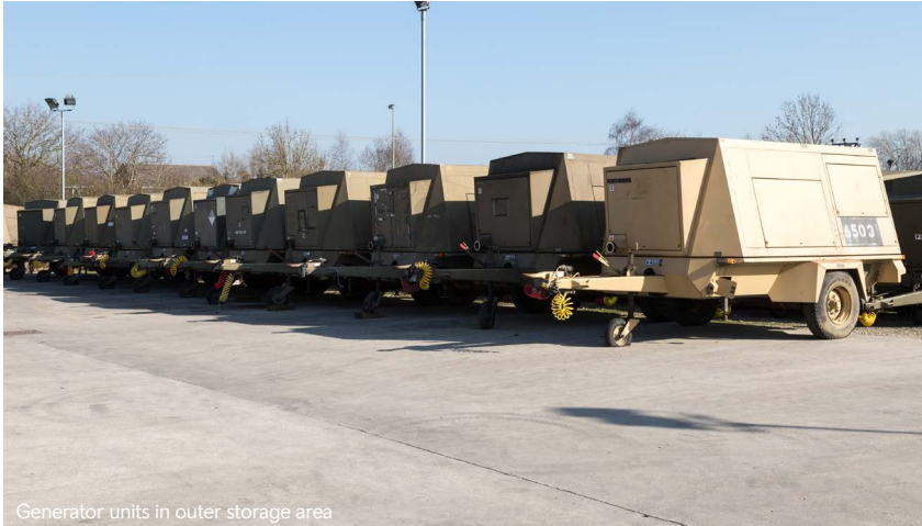
Generator units in outer storage area

Our UK premises are fully flexible to best suit our customers' requirements whether for production or equipment services. Current testing capabilities include 7 test beds, and on-site Electro Magnetic Compatability (EMC) testing. Test beds feature electrical load banks, a water brake dynamometer and a simulated sea water cooling facility.