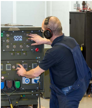
6.5kW Variable Speed Generator on Test