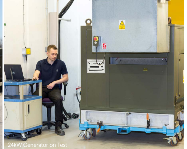
24kW Generator on Test