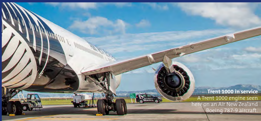
Trent 1000 in service A Trent 1000 engine seen here on an Air New Zealand Boeing 787-9 aircraft.